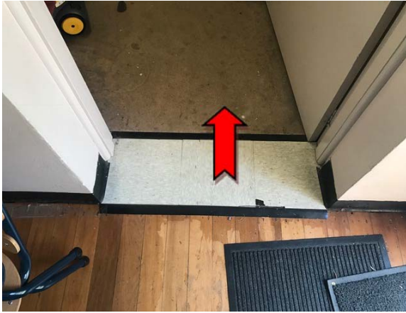
Photo 1. Interior, ground level, doorway to store 1, cream floor coverings– non asbestos-containing vinyl floor tiles.